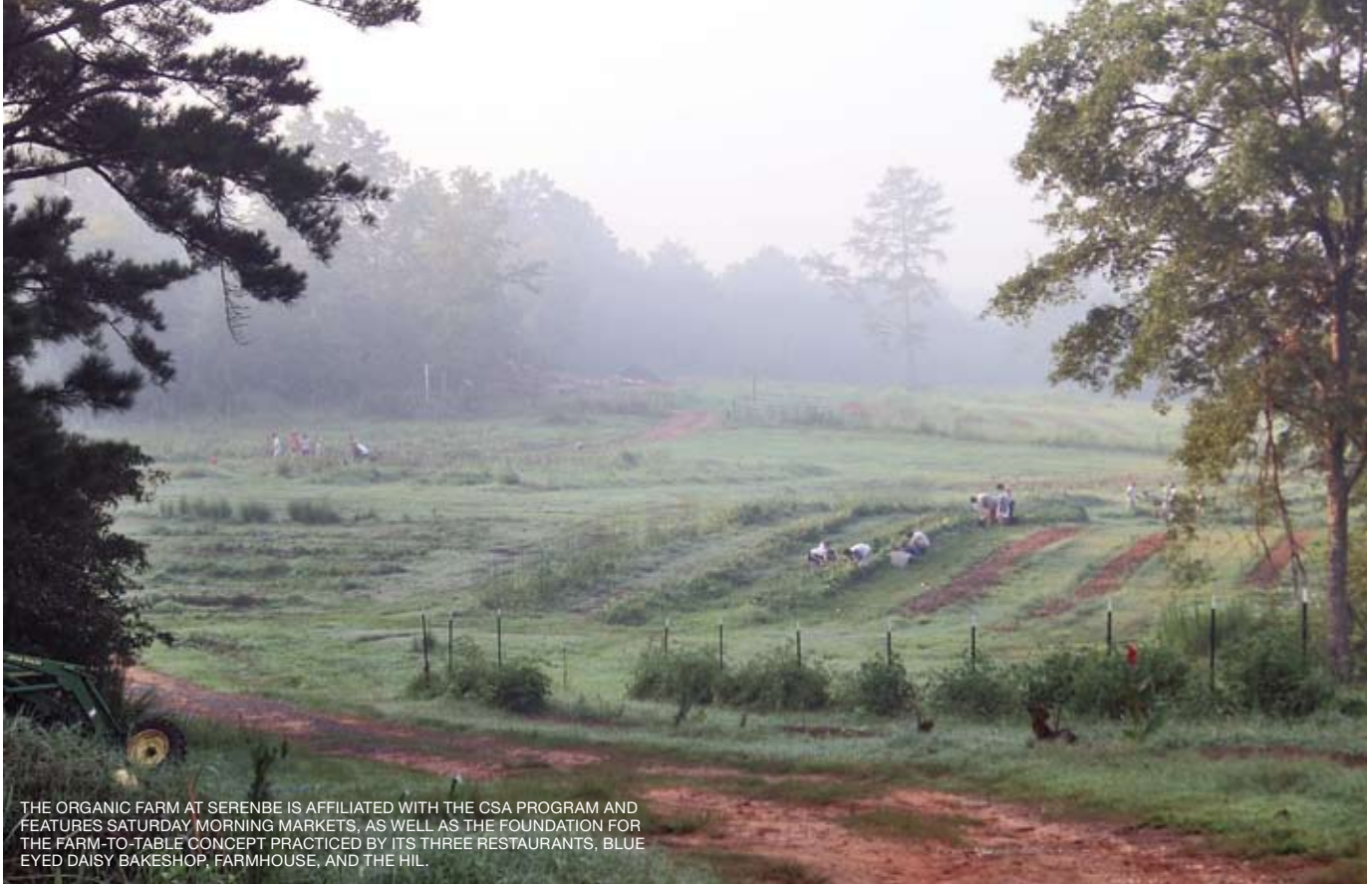
THE ORGANIC FARM AT SERENBE IS AFFILIATED WITH THE CSA PROGRAM AND FEATURES SATURDAY MORNING MARKETS, AS WELL AS THE FOUNDATION FOR THE FARM-TO-TABLE CONCEPT PRACTICED BY ITS THREE RESTAURANTS, BLUE EYED DAISY BAKESHOP, FARMHOUSE, AND THE HILL.