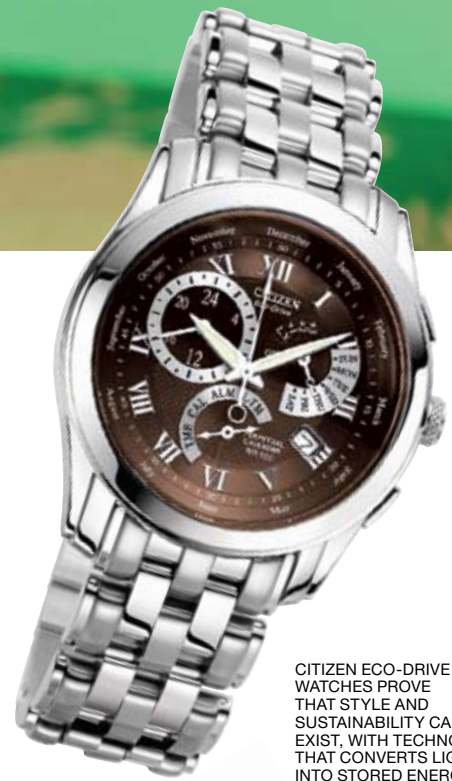
CITIZEN ECO-DRIVE WATCHES PROVE THAT STYLE AND SUSTAINABILITY CAN CO-EXIST, WITH TECHNOLOGY THAT CONVERTS LIGHT INTO STORED ENERGY TO POWER THE WATCH FOR AT LEAST SIX MONTHS, EVEN IN THE DARK. MEN'S CALIBRE 8700, $475; WOMEN'S SILHOUETTE, $425-$450. CITIZENWATCH.COM.