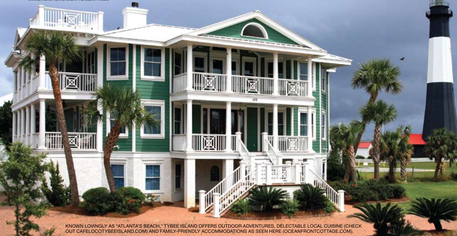
KNOWN LOVINGLY AS "ATLANTA'S BEACH," TYBEE ISLAND OFFERS OUTDOOR ADVENTURES, DELECTABLE LOCAL CUISINE (CHECK OUT CAFELOCOTYBEEISLAND.COM) AND FAMILY-FRIENDLY ACCOMMODATIONS AS SEEN HERE (OCEANFRONTCOTTAGE.COM).

stay at the green-built Inn at Serenbe, the community is a casual retreat to inspire low impact living through its acclaimed farm-to-table restaurants, featuring locally grown food from its CSA (Community Supported Agriculture) organic farm, preserved green space and community-wide environmental commitment.