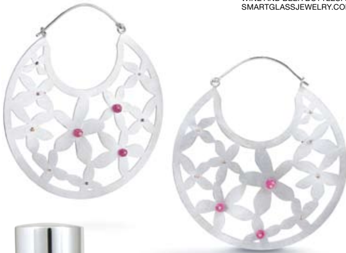
CASSAVOY & CO'S #13 FLOWER EARRINGS ARE HANDMADE FROM RECYCLED STERLING SILVER, 18K GOLD AND RUBIES. $450. CASSAVOYANDCO.COM.