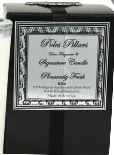
POLES PILLAR'S ORGANIC SOY CANDLE AND ROOM SPRAY, HANDMADE WITHOUT HARSH CHEMICALS, ARE AVAILABLE IN FOUR BREATHE-EASY SCENTS: PERFECTLY SWEET, PLEASANTLY FRESH, PRETTY SPICY AND PERFECT PRESENT. CANDLE, $19; ROOM SPRAY, $16. POLESPIILLARS.COM.