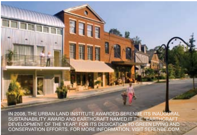
IN 2008, THE URBAN LAND INSTITUTE AWARDED SERENBE ITS INAUGURAL SUSTAINABILITY AWARD AND EARTHCRAFT NAMED IT THE "EARTHCRAFT DEVELOPMENT OF THE YEAR" FOR ITS DEDICATION TO GREEN LIVING AND CONSERVATION EFFORTS. FOR MORE INFORMATION, VISIT SERENBE.COM.

are encouraged to trade in their gas guzzling autos for bikes, fuel efficient mopeds or kayaks to experience the island's thriving wildlife and breathe-easy environment.