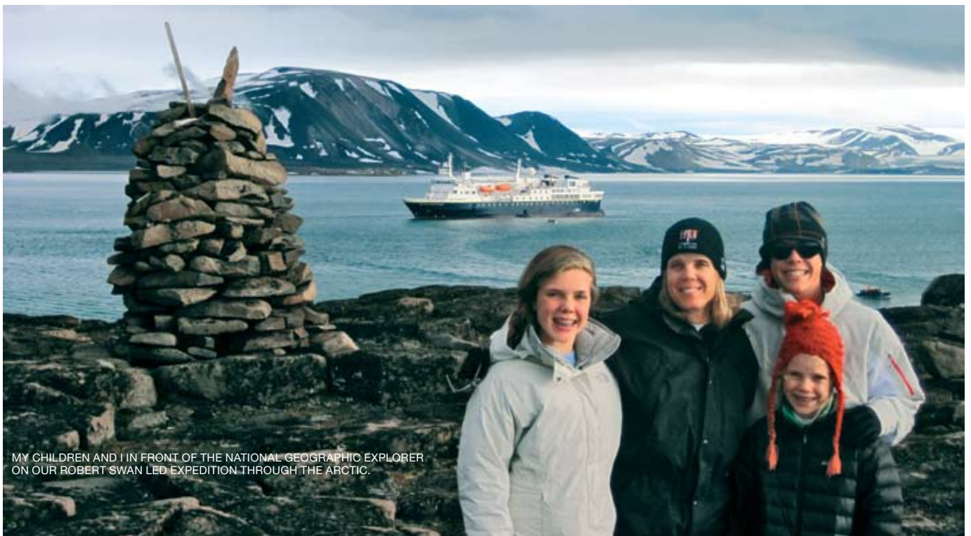
MY CHILDREN AND I IN FRONT OF THE NATIONAL GEOGRAPHIC EXPLORER ON OUR ROBERT SWAN LED EXPEDITION THROUGH THE ARCTIC.

If you're looking for an eco-weekend getaway, only a short drive from Atlanta is Tybee Island, which according to a recent national health magazine study is America's Healthiest Beach. The tiny island, totaling 2.6 square miles, is an ecologically haven boasting miles of Atlantic Ocean shoreline, tidal salt marshlands and protected wetland areas on its undeveloped barrier island, Little Tybee. Because of its small size, visitors