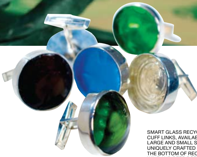
SMART GLASS RECYCLED CUFF LINKS, AVAILABLE IN LARGE AND SMALL SIZES, ARE UNIQUELY CRAFTED FROM THE BOTTOM OF RECYCLED WINE AND BEER BOTTLES. $110. SMARTGLASSJEWELRY.COM.